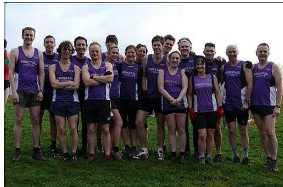
Team photo from Nell Bank PECO, courtesy of Woodentops.org.uk

Those wanting a lift or directions should meet at the LPSA at 9.30.