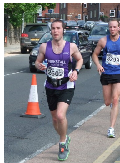
Photos: Top - Liversedge Half Marathon 2009,